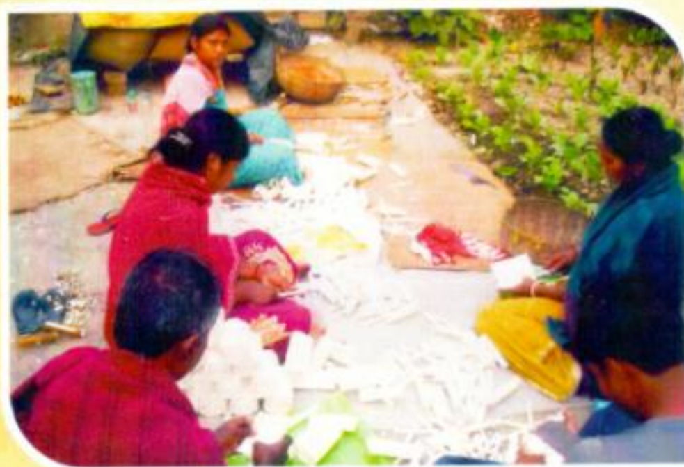
IMPROVED SOLA CRAFT