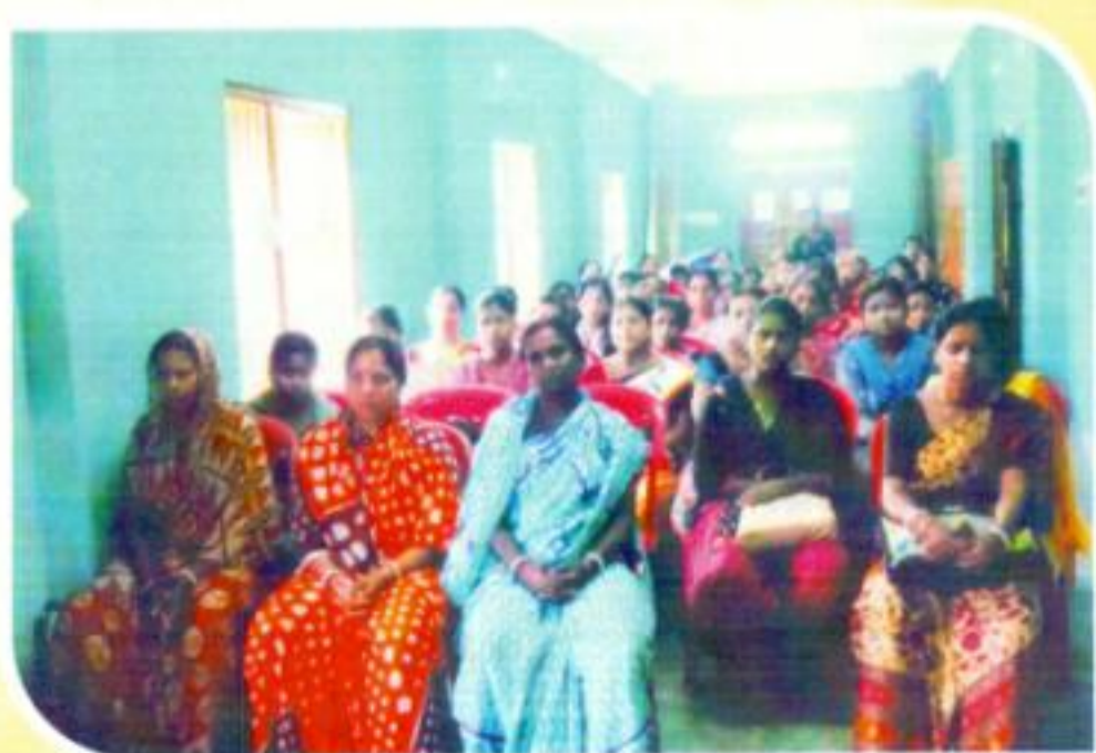
PARTICIPANTS IN AWARENESS CAMP