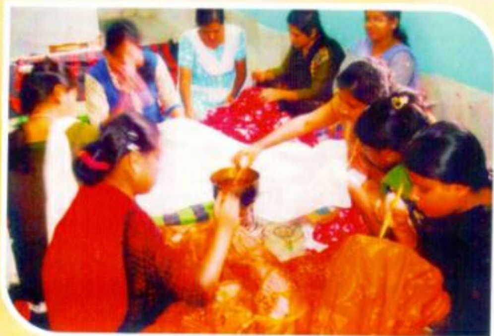
TRAINEES IN BATIK PRINTING