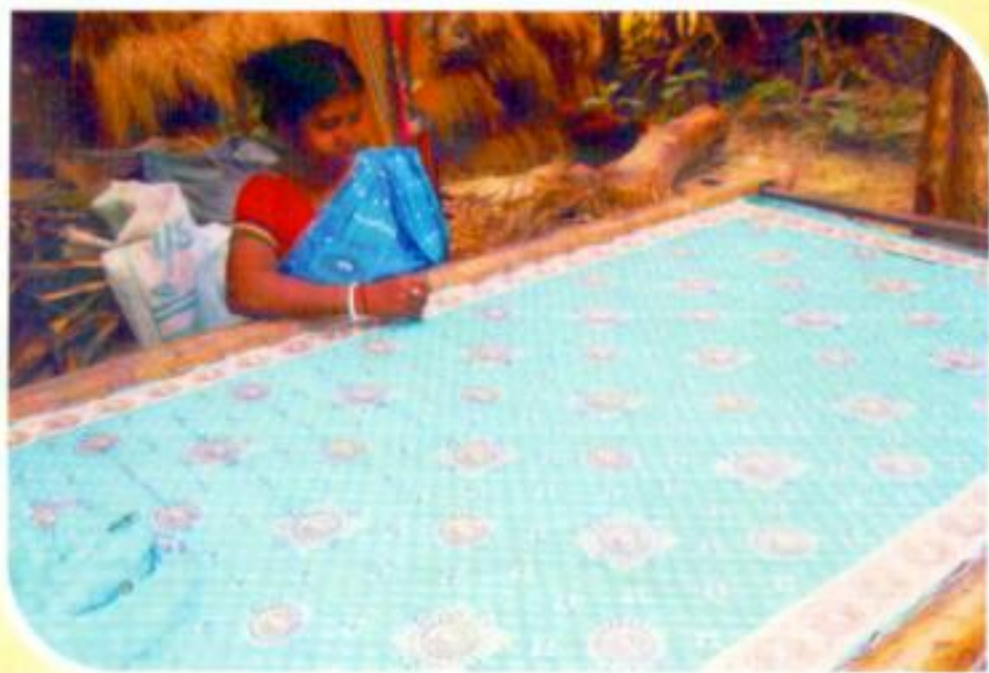
WOMAN IN ZARI CRAFT