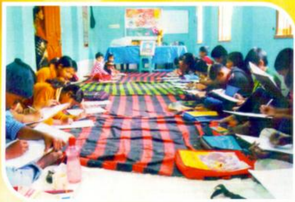
SIT & DRAW COMPETITION