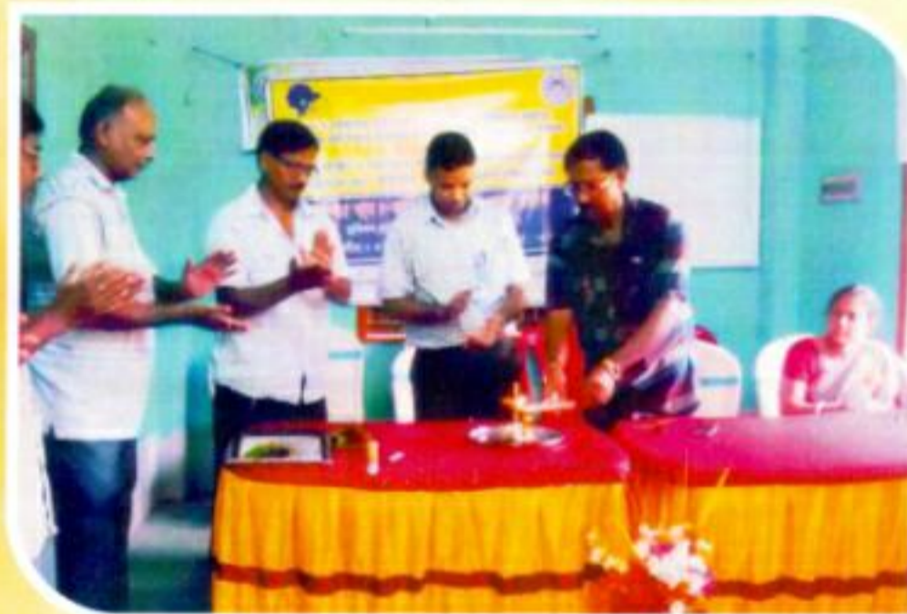
INAUGURATION OF ZARI CRAFT