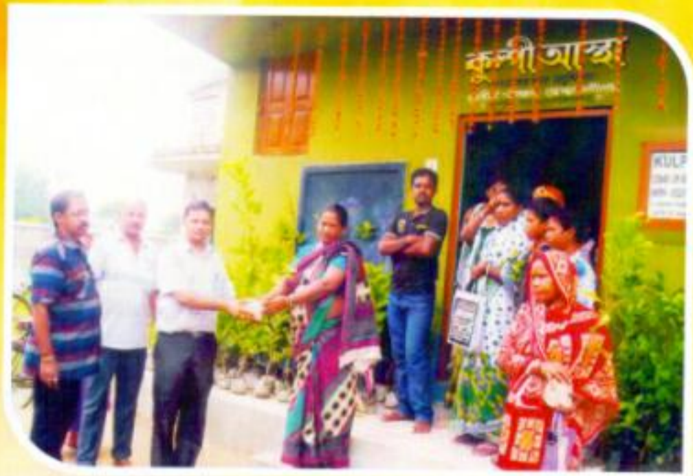
PLANTATION-MAKE ENVIRONMENT CLEAN AND GREEN