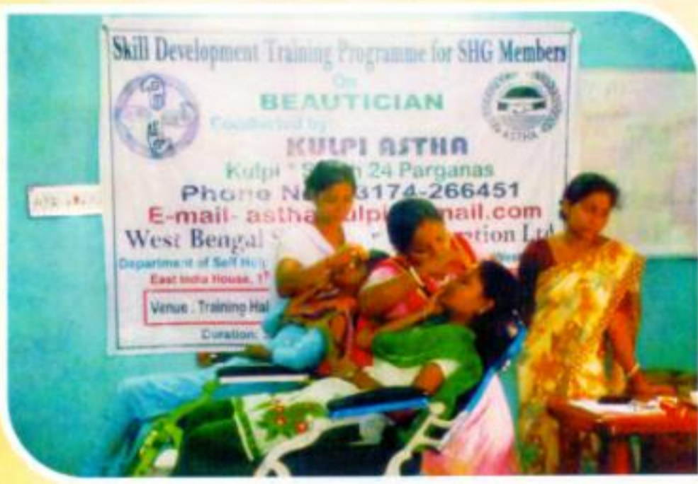
TRAINEES IN BEAUTICIAN