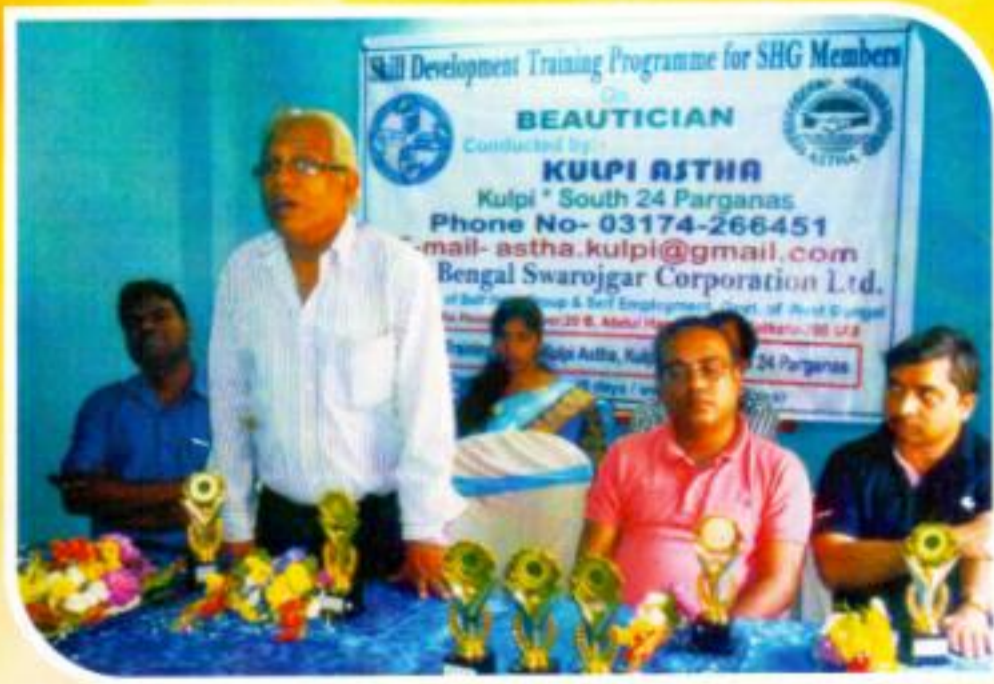
INAUGURATION OF BEAUTICIAN COURSE