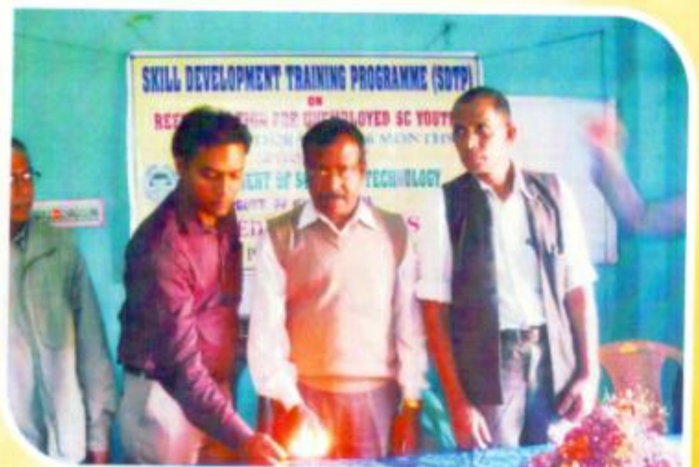
INAUGURATION OF REFRIGERATOR COURSE