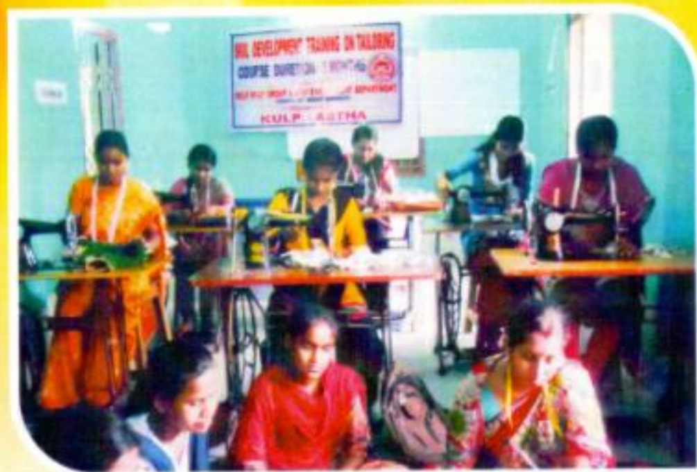
LEARNING BY DOING-TAILORING